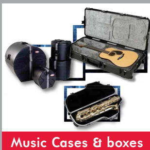
Music Cases & boxes