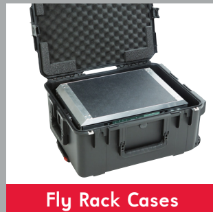
Fly Rack Cases