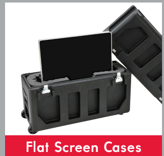
Flat Screen Cases