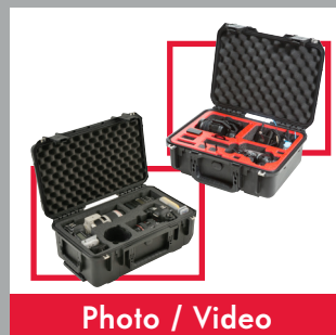
Photo / Video